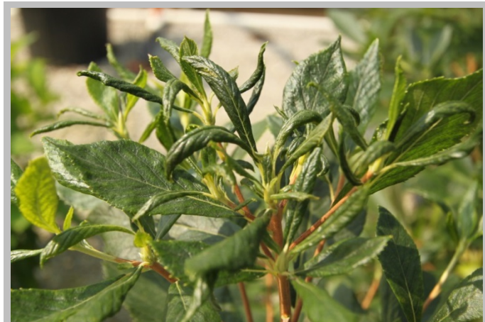
Image 3. Broad mite feeding damage on this Clethra sp. plant has resulted in small, stunted and cupped-shaped leaves that are slightly darker than the older unaffected leaves below.

Rotating chemical classes or modes of action is always wise, but this is especially important for broad mites because of their rapid lifecycle. Their ability to have multiple generations per year allows populations to quickly develop miticide resistance.