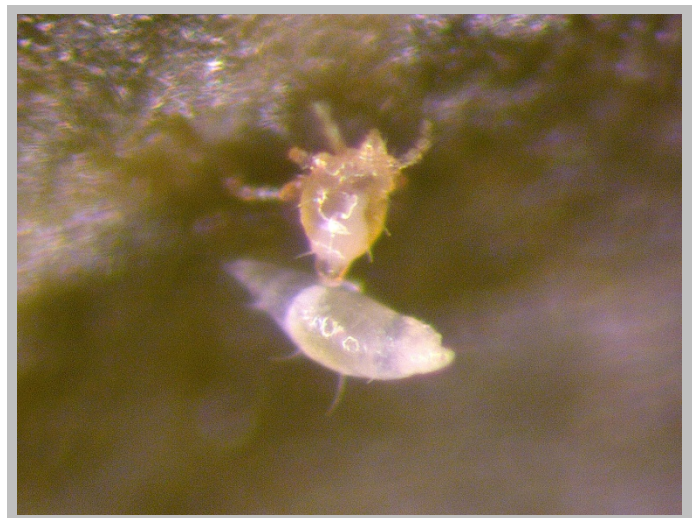
Image 5. An adult male broad mite is carrying a quiescent female. He may carry her to a new plant and begin a new generation.