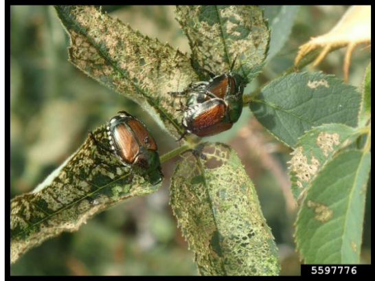
Figure 4. Adult Japanese beetles feeding on rose.

Adults are more active during the daytime and feed on the soft tissues between the veins on the upper surfaces of plant leaves, leaving behind skeletonized leaves and large, irregular holes (Figs. 4, 5). They frequently start by feeding in the upper canopy. They prefer sunny leaves over shaded ones. Trees that have sustained severe damage sometimes lose their leaves and turn brown.