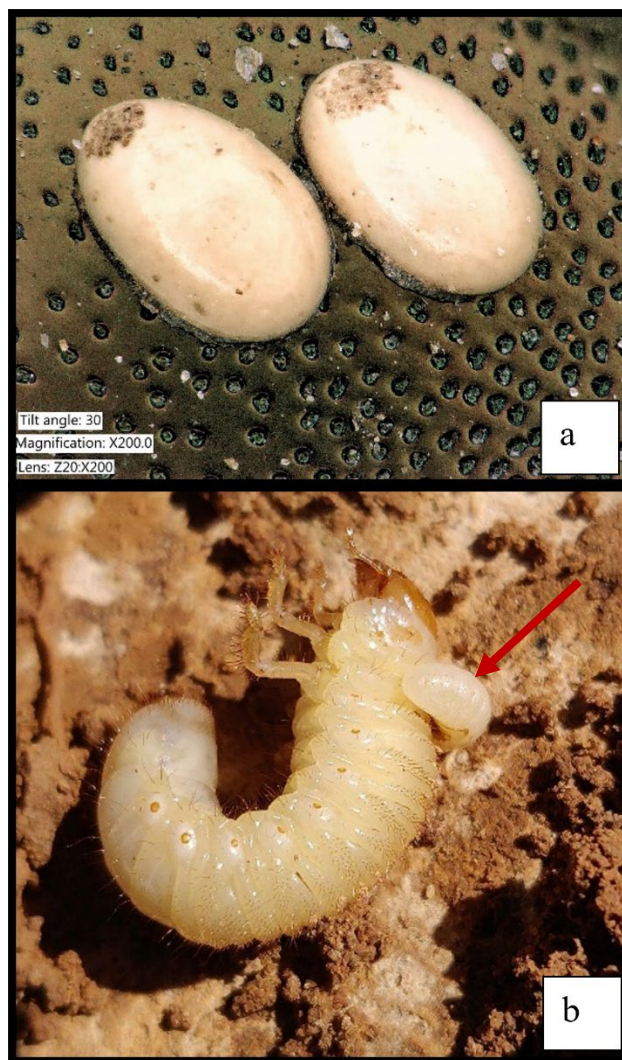
Figure 7. Japanese beetle with a) Istocheta fly eggs on the thorax of adult, b) Tiphid wasp larva on the beetle larva.

Tiphia wasps and winsome flies are not commercially available currently.