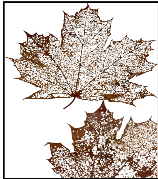
Figure 5. Skeletonized maple leaves by Japanese beetle.