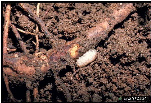
Figure 3. Larva feeding on tree roots.

Japanese beetle larvae develop in the soil and feed on plant roots (Fig. 3). They reduce the ability of plants to absorb water and nutrients, affecting plant survival during hot and dry conditions. Initial larva injury in turf appears as drought stress damage. More severe damage causes the turf to die in large, irregular patches.