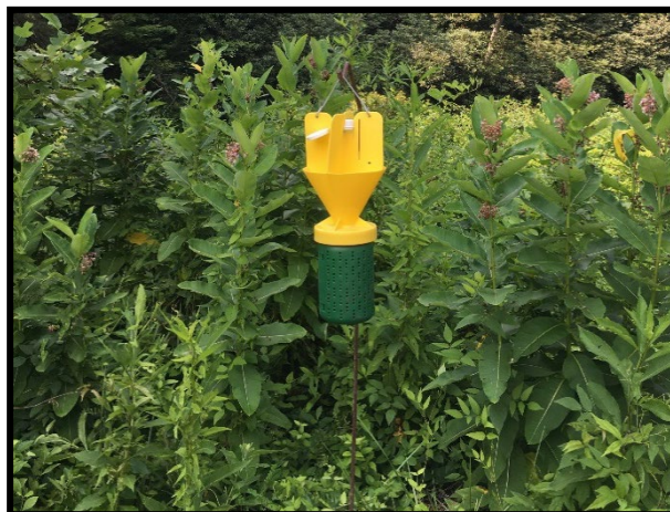
Figure 6. Trap for Japanese beetle.

Japanese beetle traps, which are commercially available, can help to control small, newly established, or isolated populations (Fig. 6). Trap lures containing a blend of beetle pheromones and plant volatiles are available. These beetles were found to be attracted to different trap colors like white, yellow, and solid green. In a recent study, solid green color traps baited with a lure made of eugenol and phenethyl propionate and female-generated sex pheromone was found effective in reducing pollinator captures and effectively increased Japanese beetle traps (Sipolski et al. 2019). These traps also are used to monitor and detect populations of Japanese beetle in new areas. High tunnels that block ultraviolet light can be used in small fruit crops to keep the beetle away from the plants. The proper placement of traps is essential, as lures and traps placed near host plants often attract adult beetles to the vicinity of hosts, causing more damage on adjacent crops.