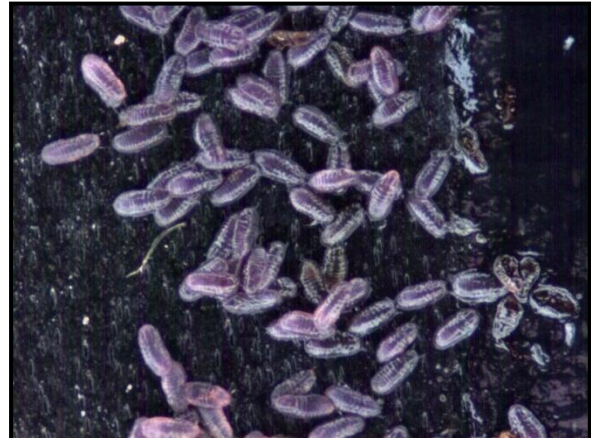
Image 3. A strong hand lens or dissection microscope is required to see the Japanese maple scale juveniles, also called crawlers.

The lifecycle and activity pattern of JMS in the southeastern United States is not completely understood. This makes management decisions difficult. Each female scale lays approximately 25 eggs which are protected under their waxy armor. In middle Tennessee, the first eggs start hatching in early May coinciding with the blooming of Japanese lilac ( Syringa reticulata 'Ivory Silk') and oakleaf hydrangeas. From the eggs, small, purple, wingless juveniles called crawlers emerge ( Image 3 ) to seek out new feeding sites on the surface of the plant. This is the only stage of JMS that is capable of infesting new plants. The crawlers may be transferred to new plants by wind or walking onto adjacent, touching plants. Other species of armored scales have been shown to hitch rides on other flying insects or birds present on infected plants, suggesting another possible means of JMS dispersal.