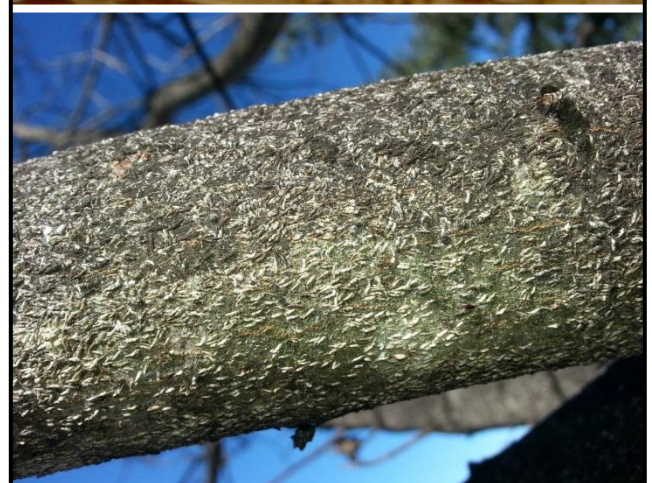
Image 1 (top). The individual Japanese maple scales are oyster-shaped, 1-2 mm long, and off-white in color.

Image 2 (bottom). If left, un-treated, Japanese maple scale populations can increase exponentially to where nearly the entire surface of the bark is covered.