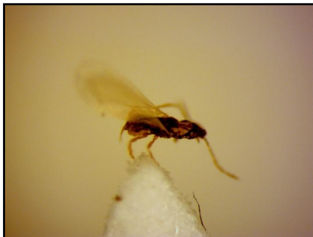
Image 4. A good hand lens is required to see the winged males. To the naked eye, they can look like specs of debris or tiny gnats on the sticky trap.