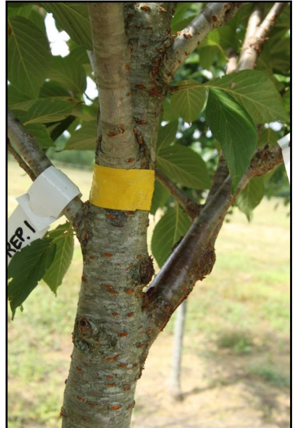
Image 5. Simple sticky traps are used to monitor the Japanese maple scale, and other scale species, to determine when the mobile crawlers become active.

An annual application of dormant oil has been shown to provide good control for the majority of scale species with complete coverage. In our evaluation, 30 days after dormant oil was sprayed, the percent of live JMS significantly fell from around 60% to 15% ( Table 1 ). However, many nursery growers have reported that a single, annual, application of dormant oil is only providing satisfactory JMS control after years of observations. Other scale species that have only one generation per year might be effectively controlled with this one annual application of dormant oil, but JMS has two generations per year. JMS is also small, able to hide in bark fissures and under mulch and leaf litter around the root zone. The individual scales that escape